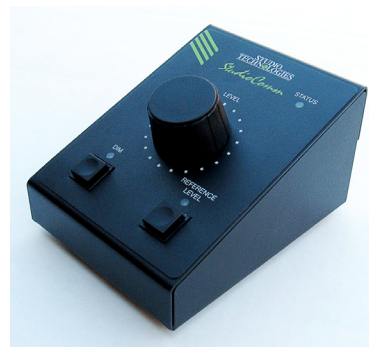
Model 71 Control Console

The Model 76D occupies one space (1U) in a standard 19-inch rack. Digital audio sources are interfaced with the Model 76D using nine BNC connectors. A tenth BNC connector is used by the sync source. Digital monitor output signal connections are made using a 25-pin D-subminiature connector. One 9-pin D-subminiature connector is used to connect the Model 76D with up to four Model 77 or Model 71 Control Consoles. A second 9-pin "D-sub" connector is used to interface with remote control signals. AC mains power is connected directly to the Model 76D, with an acceptable range of 100 to 230 volts, 50/60 Hz.