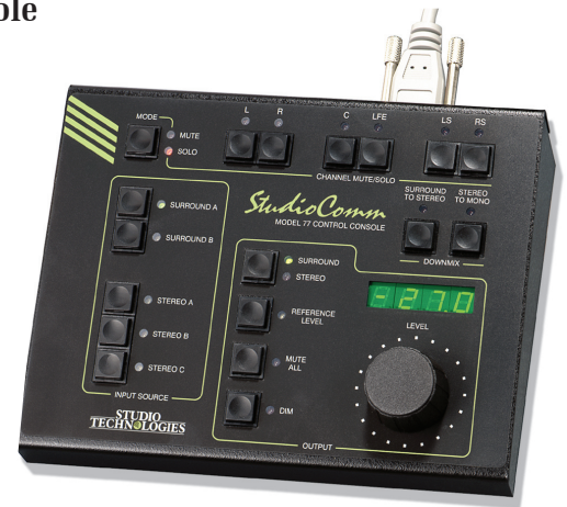
Model 77 Control Console

The core of this StudioComm for Surround system is the Model 76D Central Controller. The one-rack-space unit contains circuitry that supports digital audio inputs, digital monitor outputs, processing, and the user interface. The Model 76D provides two surround (5.1) and three stereo digital audio inputs. These unbalanced digital inputs are AES3-compliant; sources of this type are ubiquitous in most post-production and broadcast environments. The inputs allow a sample rate of up to 192 kHz and a bit depth of up to 24 to be directly supported. Circuitry associated with one of the stereo inputs provides sample rate conversion (SRC) capability, allowing a wide range of digital audio sources to be monitored. Up to 340 milliseconds of input delay can be selected to compensate for processing delays in an associated video path. For flexibility, two delay values can be configured, allowing real-time selection as desired. A number of different signals can serve as the Model 76D's digital audio timing reference. For synchronization with a master timing reference a dedicated source of word clock, DARS (AES11), bi-level video, or tri-level video can be connected. Alternately, the L/R connection of the actively selected surround or stereo input source can serve as the timing reference.